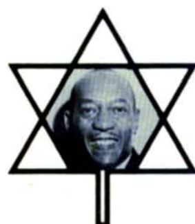
JESSE OWENS — Track great - fastest centennial in 1936 - 4 gold medals in Berlin. Later beat race-horses (running).