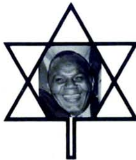
JERSEY JOE WALCOTT — Boxer. "Cream" of World Heavyweights early 50's. Can still handle Wrestlers.