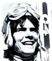
KEN READ Skiing Canadian Male Athlete of the Year