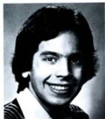
BRIAN POCKAR Figure Skating Canadian Men's Figure Skating Champion