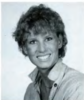
Best Wishes Carolyn Waldo CAROLYN WALDO Silver Synchronized Swimming

THE CALGARY BOOSTER CLUB TAKES PRIDE IN RECOGNIZING THE CALGARY ATHLETES WHO WON MEDALS AT THE 1984 OLYMPIC GAMES IN LOS ANGELES