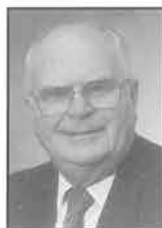
1996 Ted Rhodes