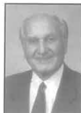
1992 Tony Anselmo