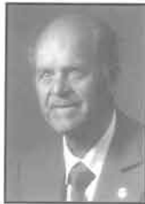
1971 Charlie Scott*